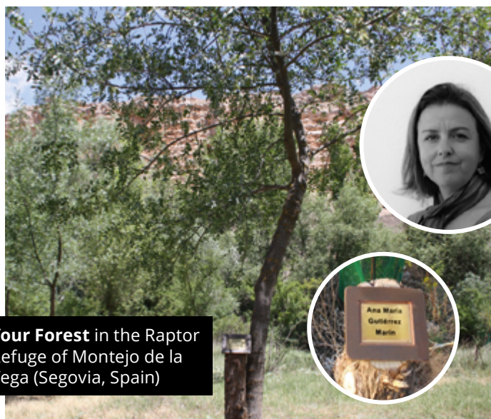
Your Forest in the Raptor Refuge of Montejo de la Vega (Segovia, Spain)

"I appoint a legatee in (indicate assets or amount of money), from the disposable portion of the estate to the Association for the Defence of Nature, WWF/Adena, to be used for the carrying out of its purposes."